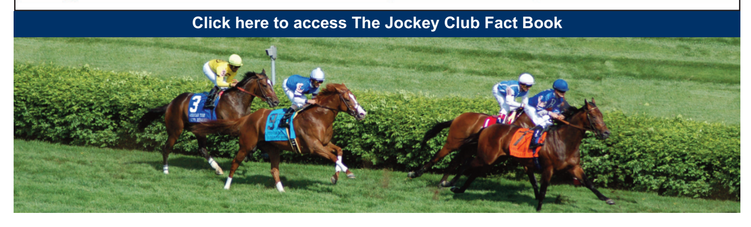
Equine Research News is the digital newsletter of the Grayson-Jockey Club Research Foundation 501(c)(3) organization